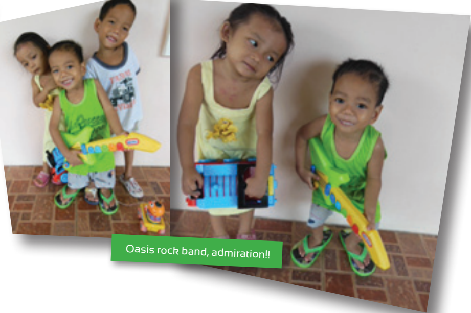
Oasis rock band, admiration!!

It was great to hear accounts of those who have been blessed by our visits and many who have been healed by the Lord.