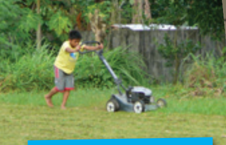
Lawn mowing time