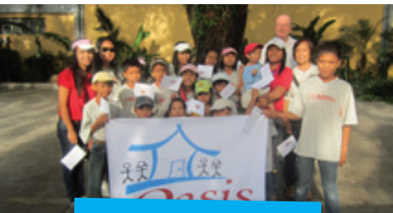
Oasis Christian Home Family