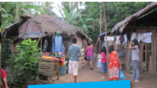
Food to the poorest of the poor