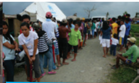
Distributing relief supplies to some of the 800 families after the typhoon.