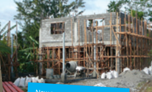
New accommodation building