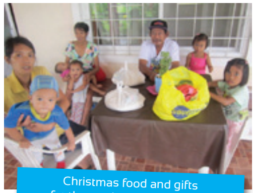
Christmas food and gifts for those who have very little, man in the middle is blind.