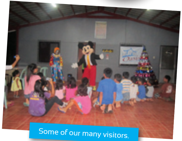
Some of our many visitors.