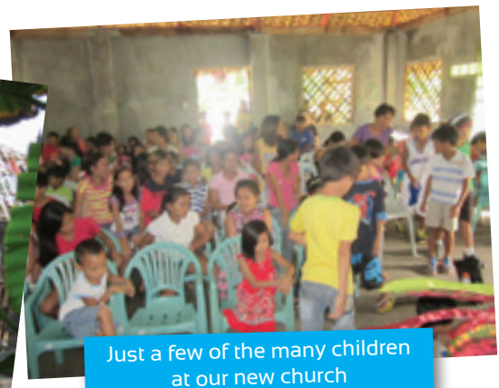
Just a few of the many children at our new church Christmas party.

The children were thoroughly spoiled at Christmas with many parties sponsored by different locals from a bank social group, friends and a high school. More than half of the children have gone to spend time with extended families before resuming school on January 4.