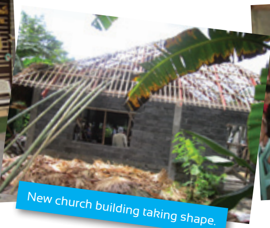
New church building taking shape.